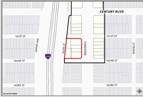
Maps created by CRA/LA GIS Team