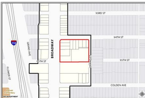
Maps created by CRA/LA GIS Team