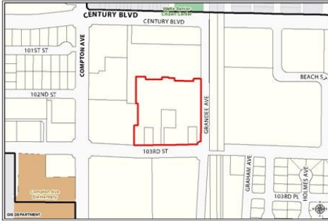
Maps created by CRA/LA GIS Team